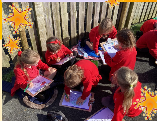
Reception class enjoying their busy learning outside while the sun was shining!